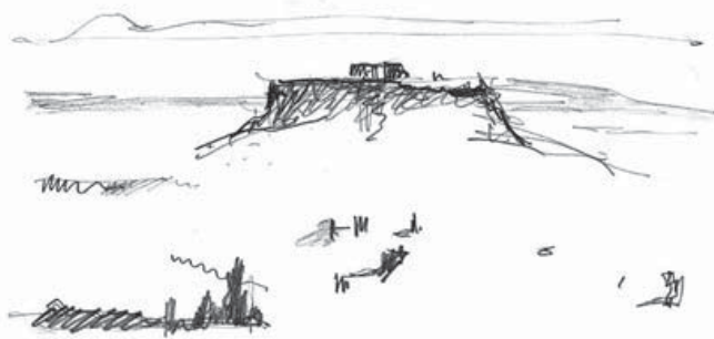
Figure 3. Composition analysis p 98. SH

unclear relationship between parts. Whilst the foreground objects (apparently fragments of trees and city) do no more than place the acropolis in the middle distance, the other elements show the minimum parts which Le Corbusier considered essential to the nature of the view. These included the nearby coastline, horizon and mountainous skyline framing the sea and sky in the distance. Whilst there is some emphasis on the temple of the Parthenon itself (the darkest tones in the sketch and centrally located in the composition), the building effectively merges with the walls and cliffs of the Acropolis silhouetted against the sea to the South beyond.