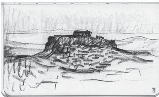
Figure 4. Le Corbusier, Carnet 3, p 103. Voyage to the Orient

The silhouette of the Parthenon against the sea (distinctly below the level of the horizon) gives almost as much importance to the distant mountains as to the temple.