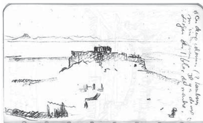
Figure 2. Le Corbusier, Carnet 3, p 98. Voyage to the Orient

The following analysis highlights which elements gain or lose importance over the course of the sketches, and which ideas are maintained or added and which are modified or removed. These conclusions can be seen in the original sketches and illustrated with conceptual diagrams. They demonstrate how Le Corbusier's opinions regarding the most significant aspects of the Acropolis changed over time.